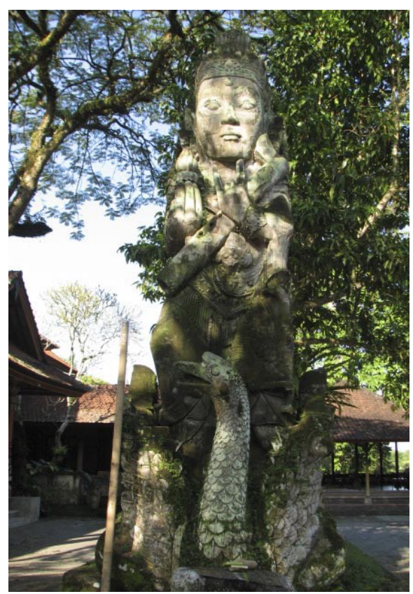
Dewi Saraswati statue at Neka Art Museum, Ubud Bali