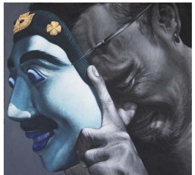
Layer After Layer # 5, 2010, 140 cm x 150 cm, acrylic on canvas