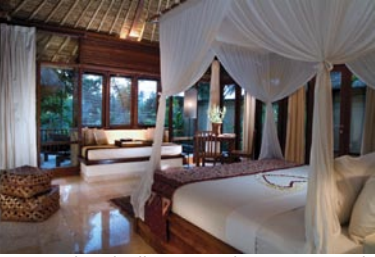
Courtyard Pool Villa, Komaneka at Tanggayud