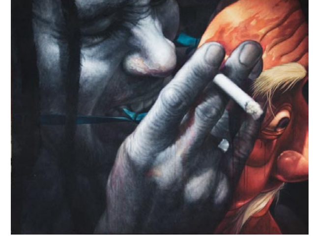
Layer After Layer # 3, 2010, 140 cm x 180 cm, acrylic on canvas

Returning to his own context of the self, the final piece in this series shows his desire to praise God for the victory in the truth of 'pronouncing the winner' in one's own self, and that 'the enemy' actually is also within oneself, not someone else.