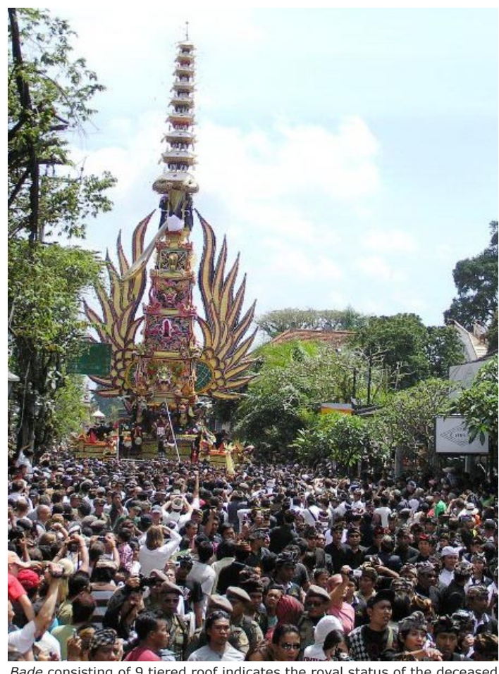
Bade consisting of 9 tiered roof indicates the royal status of the

As the ox and tiered bier procession makes it's way to the cemetery in Dalem Puri, electric and telephone wires for 900 meters from the Ubud palace to the grave at Dalem Puri are disconnected for a while. But the public understands this as the 24-meter high tower funeral bier passes through the streets. On