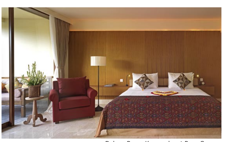
Bisma Suite Komaneka at Bisma