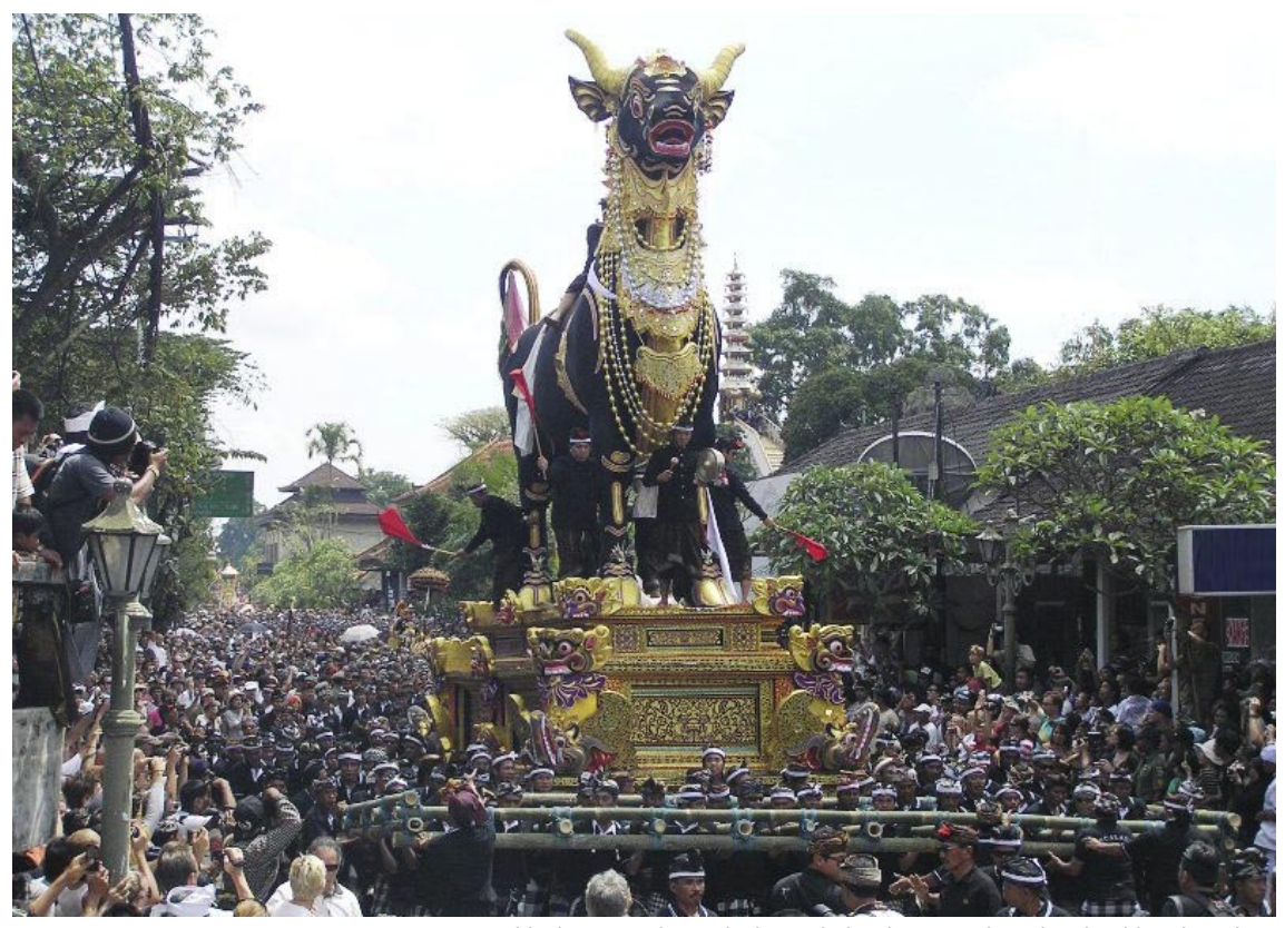
Ox, black cow replica, which needed to be carried on the shoulders by relays