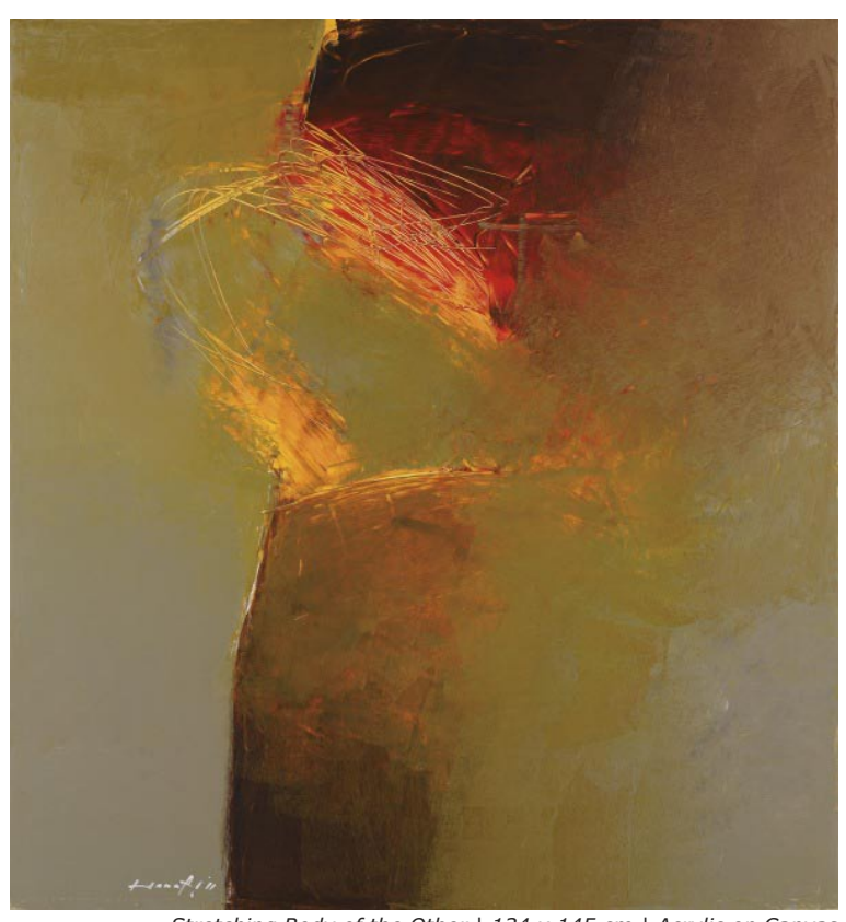
Stretching Body of the Other | 134 x 145 cm | Acrylic on Canvas