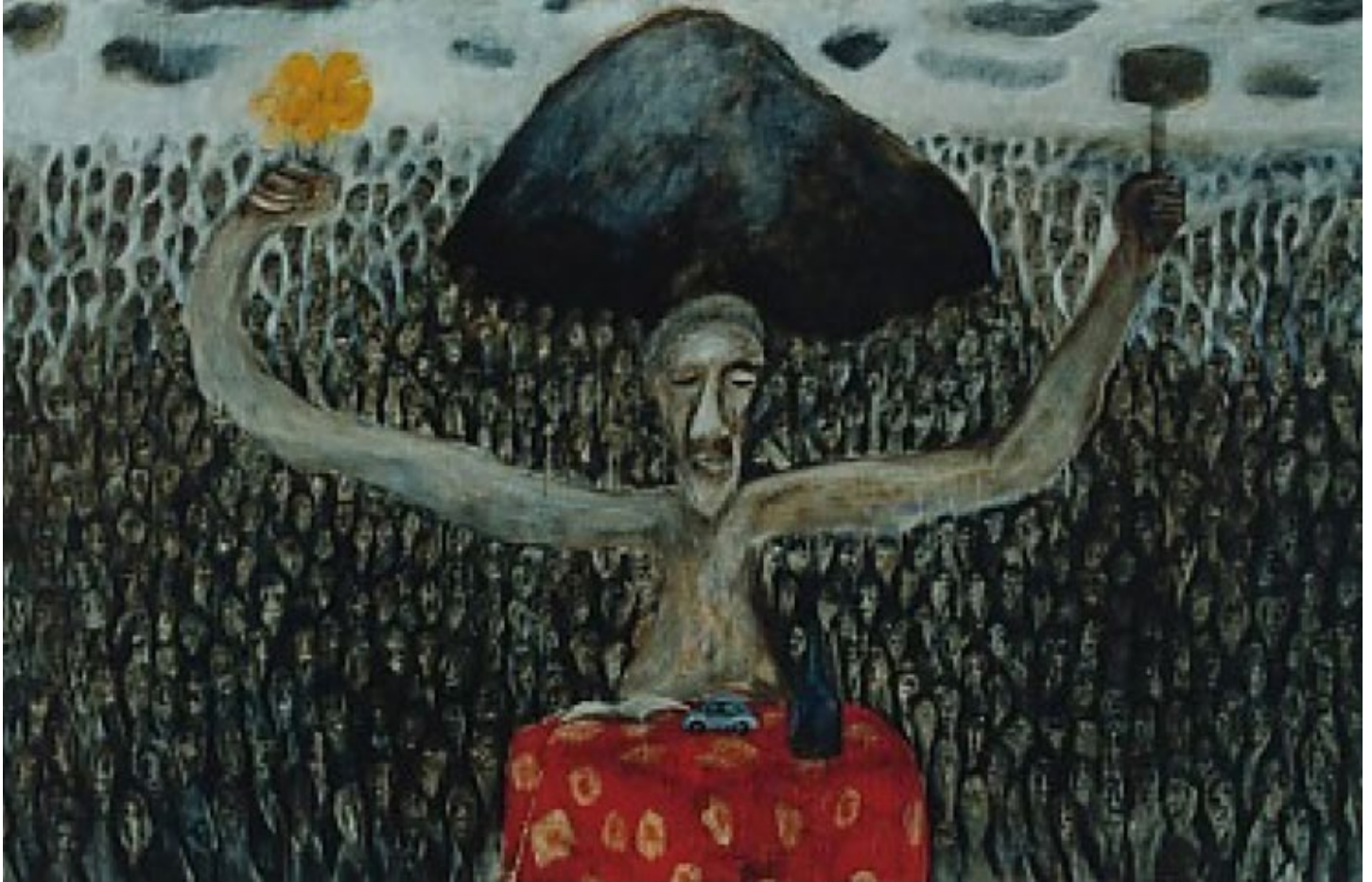
Semuanya Ada Di Tangan Kita | 190 x 290 cm | acrylic on canvas | Pande Ketut Taman