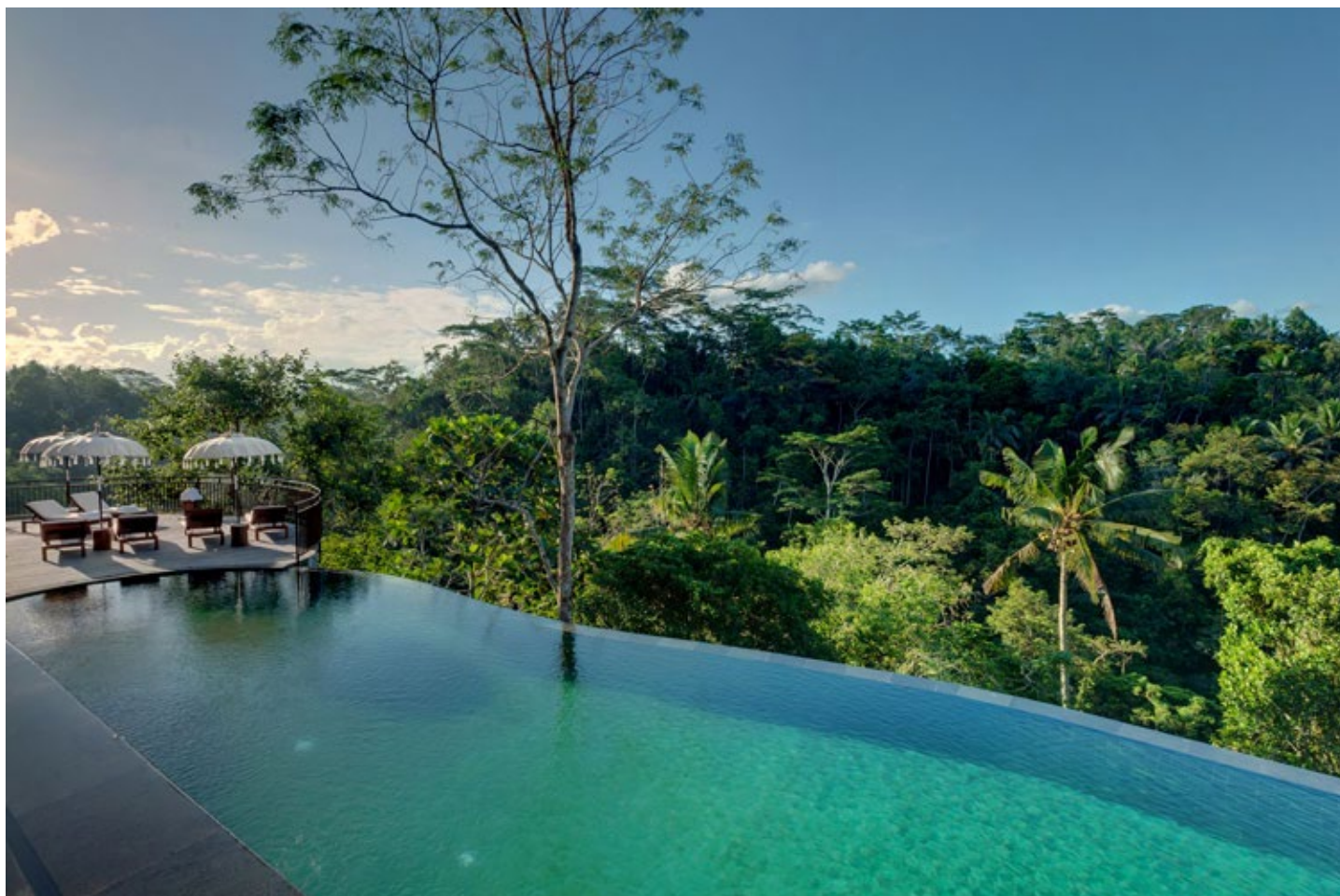
Venue: Batukaru Pool – Komaneka at Tanggayuda

Consider a soulful retreat in a serene part of Bali. If you are looking for a getaway in Ubud, you will love our Komaneka at Bisma, within walking distance of Ubud's main attractions, or Komaneka at Tanggayuda overlooking a forested valley in a nearby village. They both offer ample space and privacy to enjoy leisure to the fullest. Or, if you need seaside solitude, Komaneka at Keramas Beach is a perfect escape.