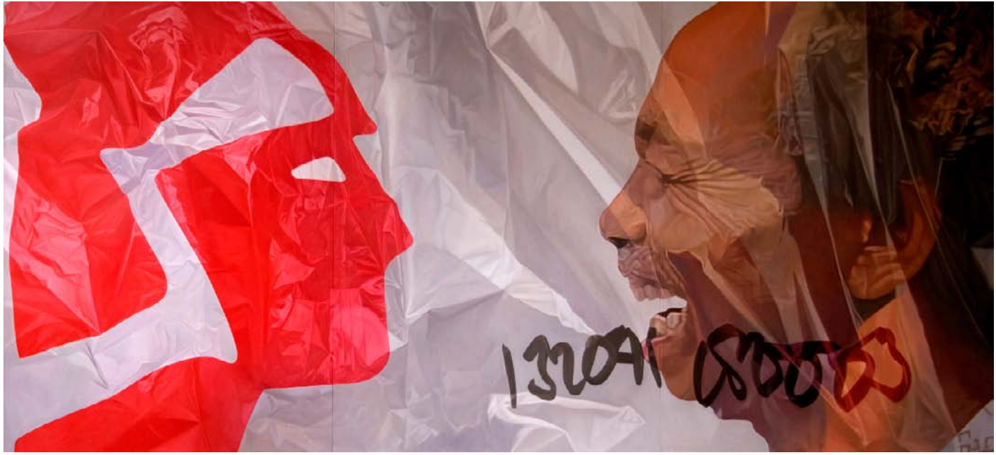
Negotiation, Oil on canvas, 200x450 cm (Triptych), 2007