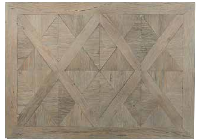
Headboard Blanc D'Ivoire, Dh4,180