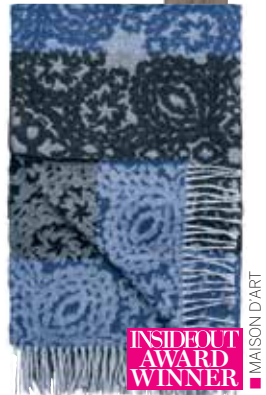
Blanket Maison d'Art, Dh1,540