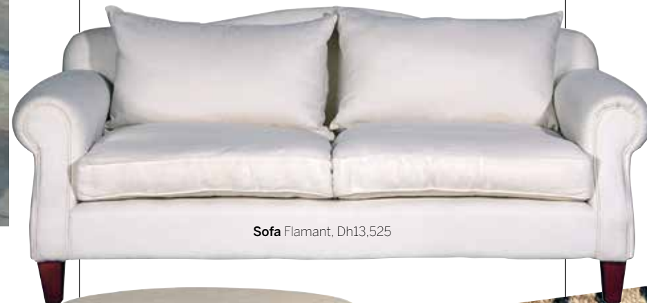
Sofa Flamant, Dh13,525