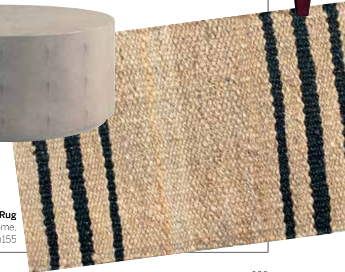
Rug Zara Home, Dh155