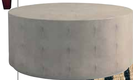
Coffee table Indigo Living, Dh4,390