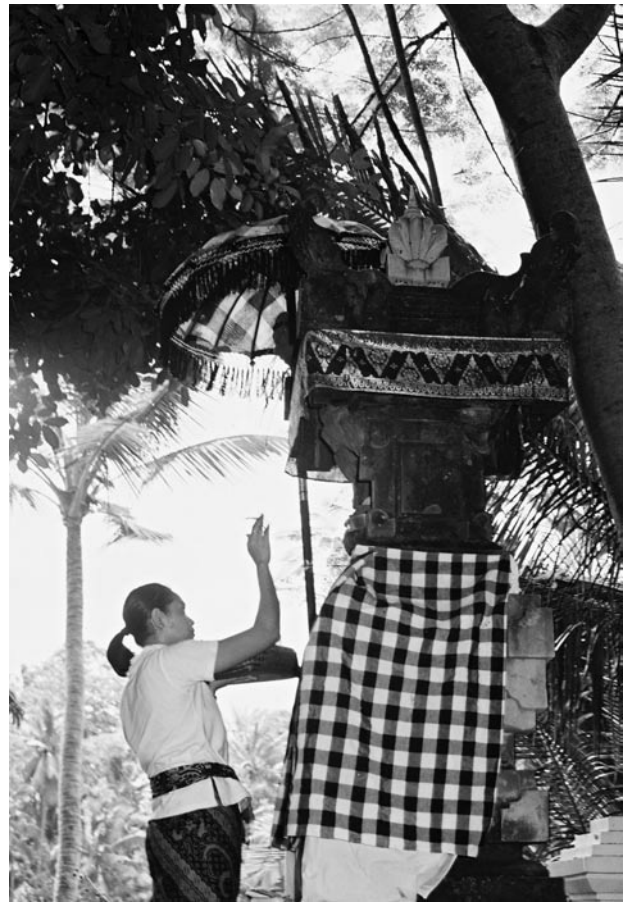
Offerings at Komaneke at Bisma shrine