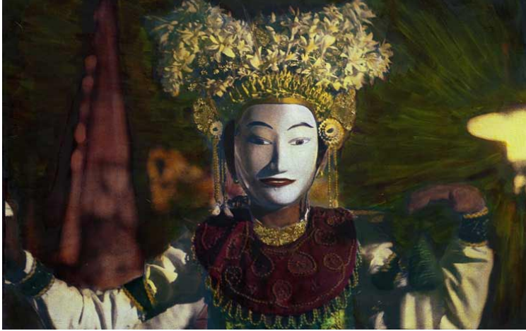
Legong Dedari | 72 x 104 cm | Print on Canvas overpainted with oil paint